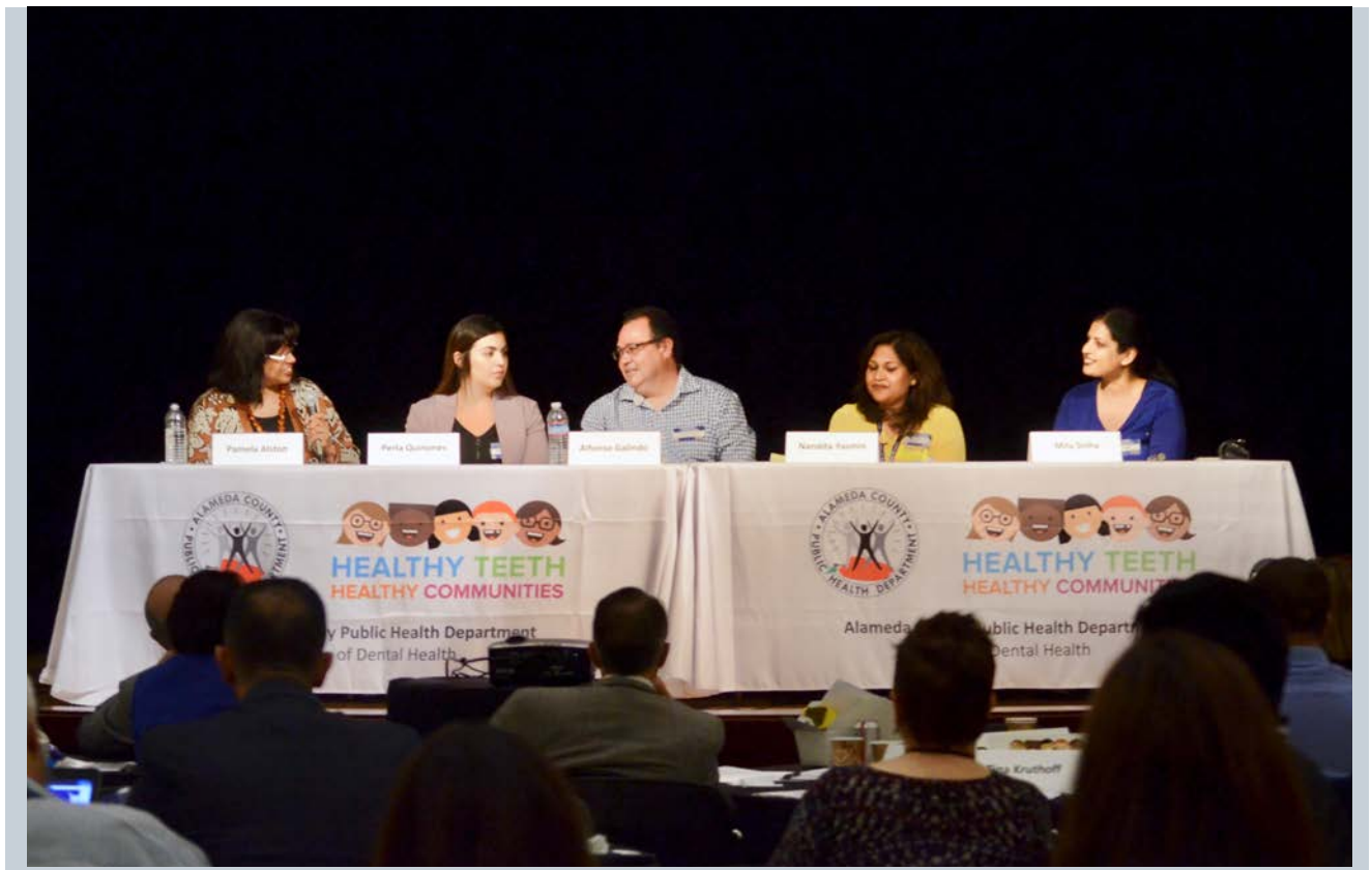
A panel of HTHC CDCCs and dentists at the 1st Annual HTHC Summit (September 27, 2018)