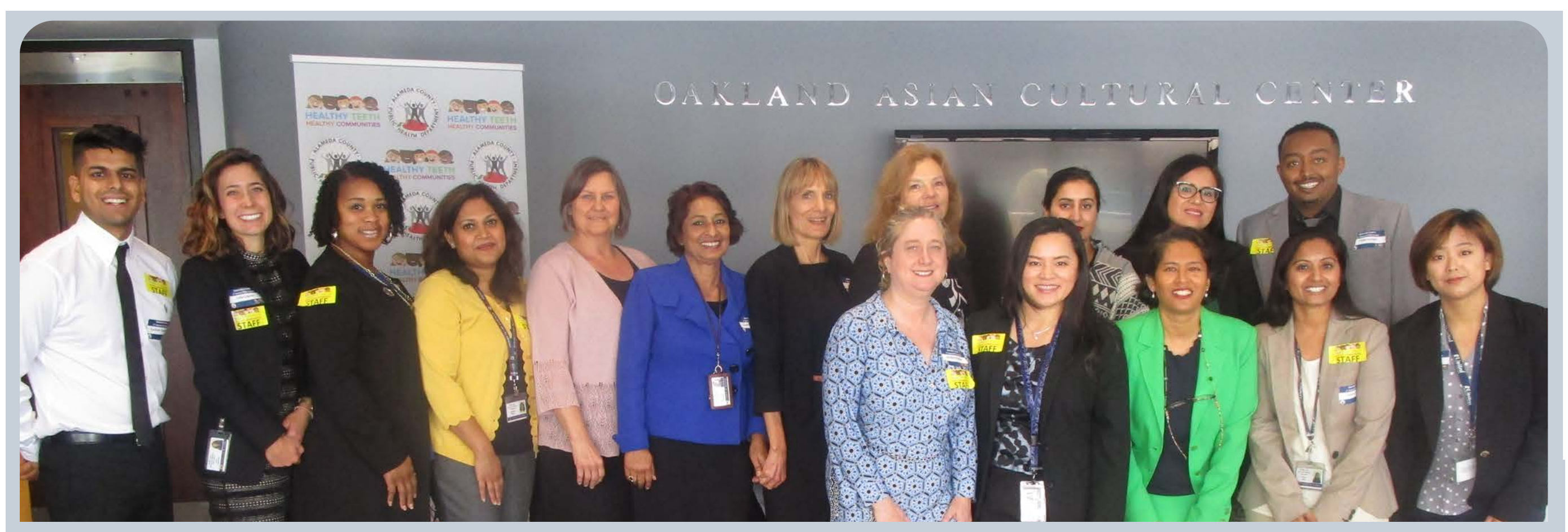
HTHC team members at the 1st Annual HTHC Summit (September 27, 2018)