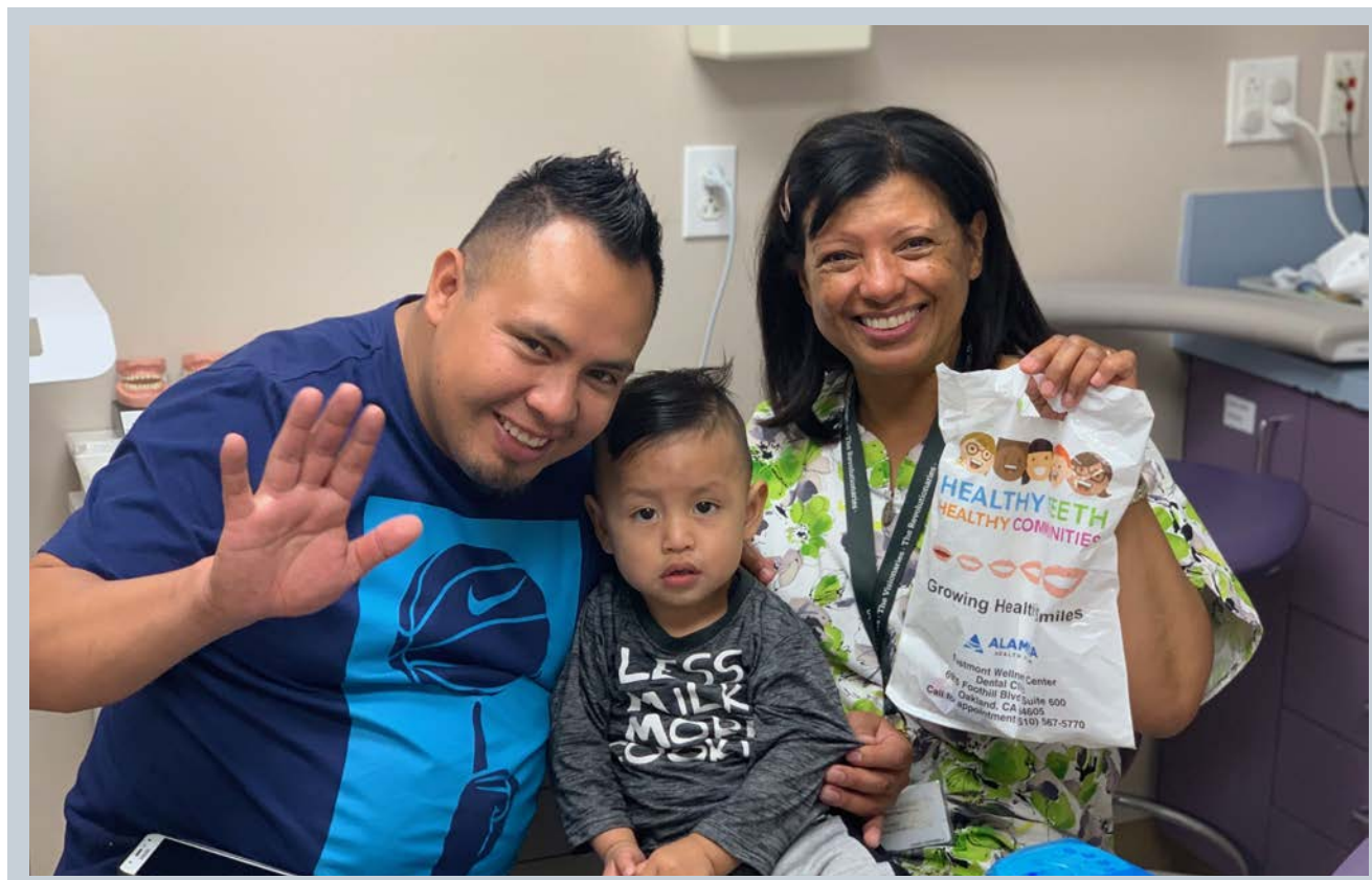
A dentist partnering with HTHC to serve a young client and his father (July 15, 2019)