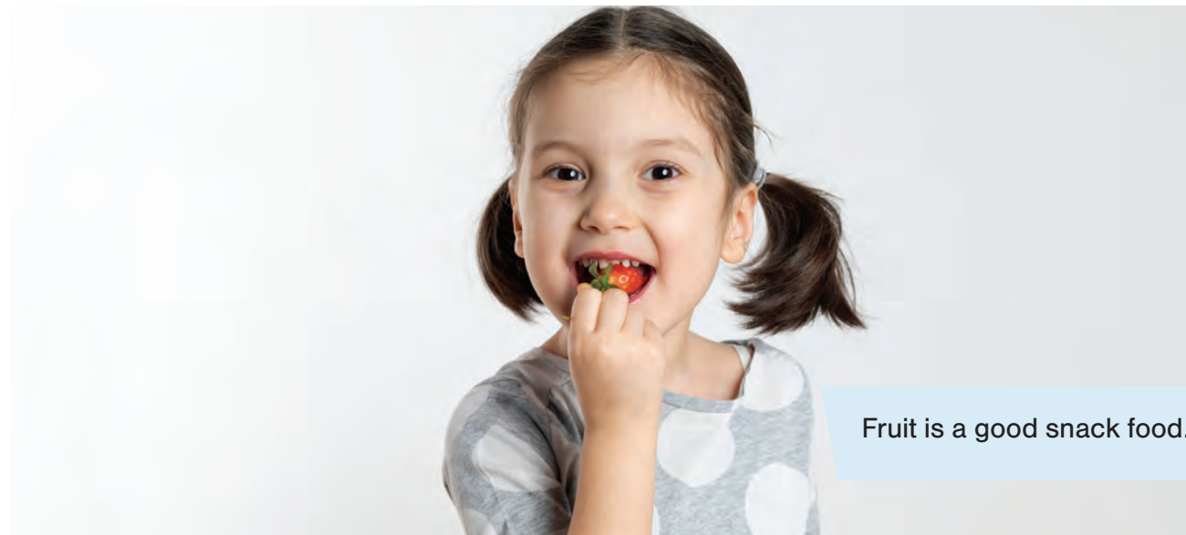
Fruit is a good snack food.

Taking care of your young child's teeth mostly means keeping up the good habits you started when they were a baby. This includes brushing twice a day, flossing, and choosing healthy snacks and meals for your child. Dental checkups every 6 months are important too.